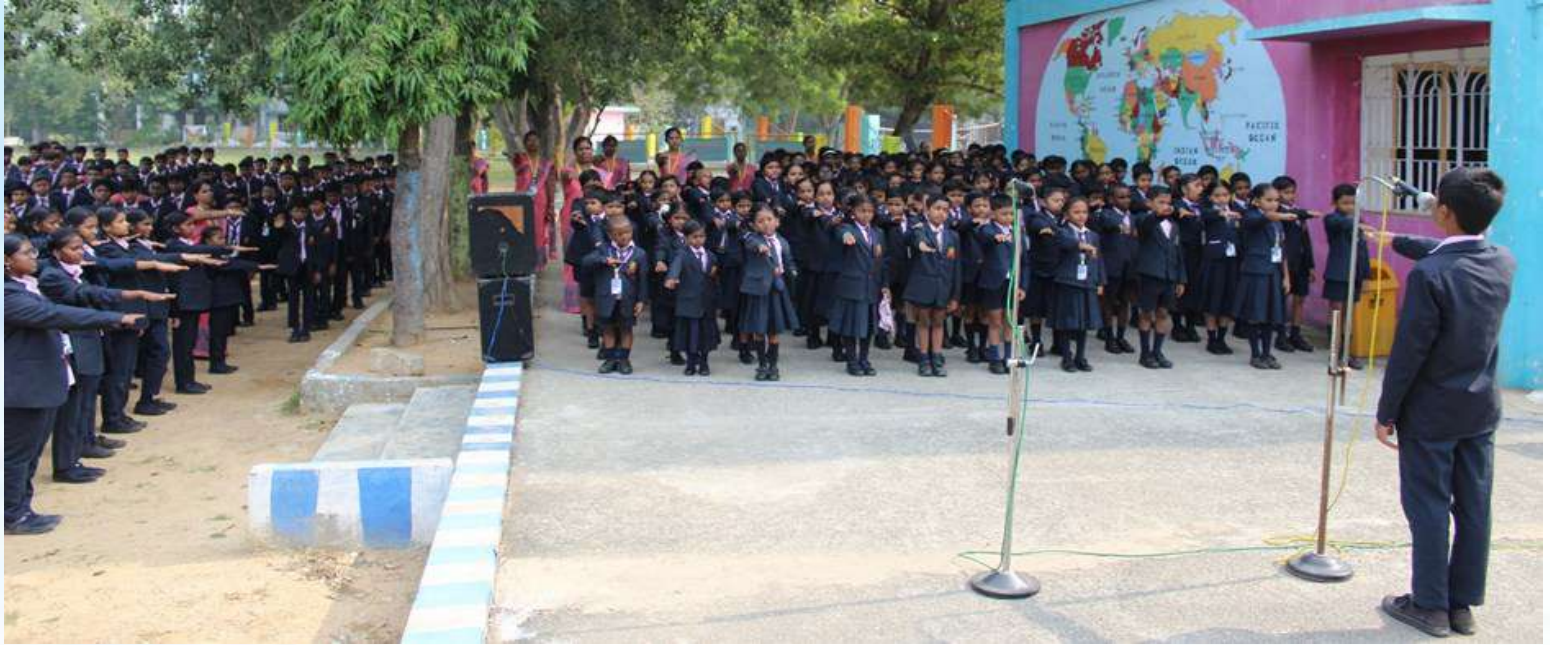
Primary students' assembly