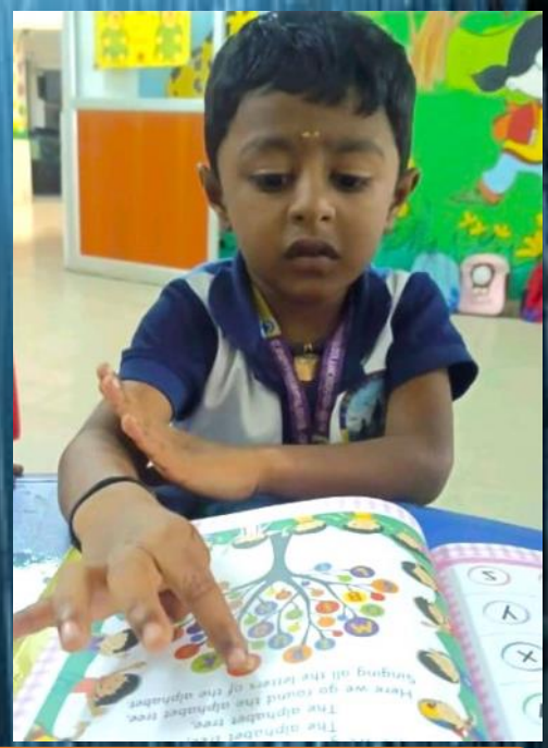
On 12.01.2025 in commemoration of Bhogi Finger print and mock Pongal Activity was conducted for the students of Kinder Garten.

Identification of Alphabetic Letters practice given on 09.01.2026