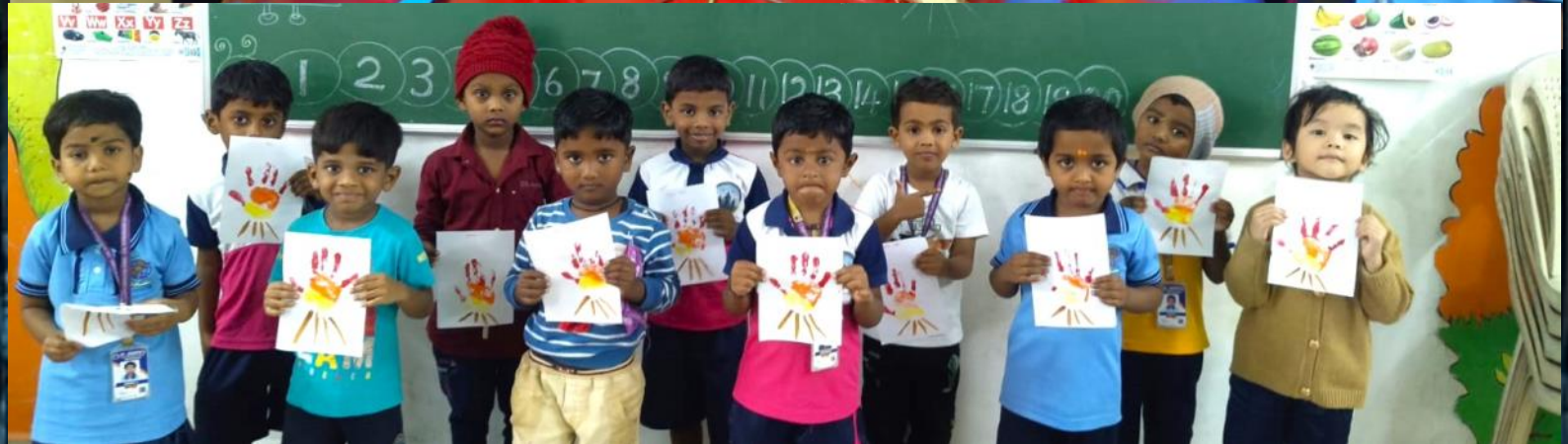
On 12.01.2026 students of KG Performed a Pot painting activity