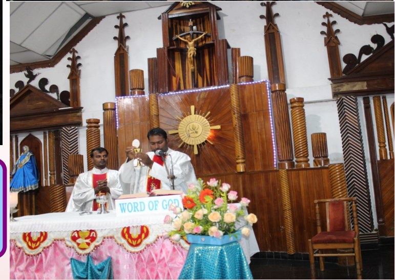
On 05.01.2024 the first Friday holy mass was celebrated.