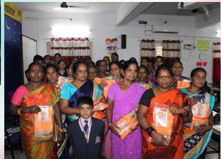
On 08.01.24 Christmas Gifts were distributed to the supporting staff.