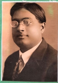
Chandrasekhara Venkata Raman