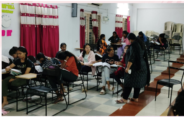
X and XII Evening Studies were conducted at AV Room